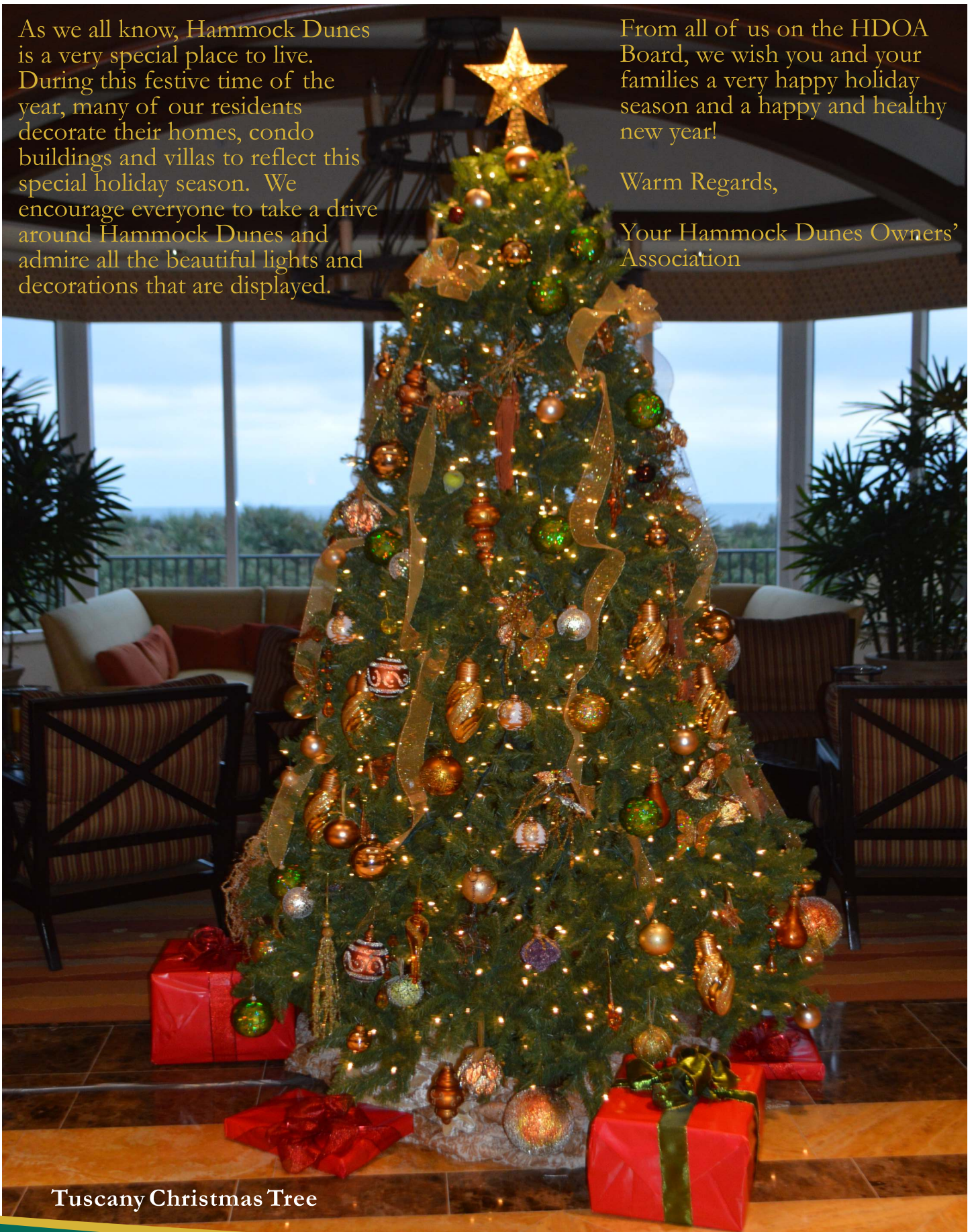
Tuscany Christmas Tree